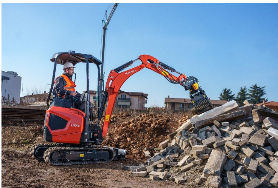
Picture: New U17-5 & U18-5

Kubota unveils the brand new U17-5, the latest in the U17 series of mini diggers, redefining excellence in the 1.5-tonne, zero tail swing range