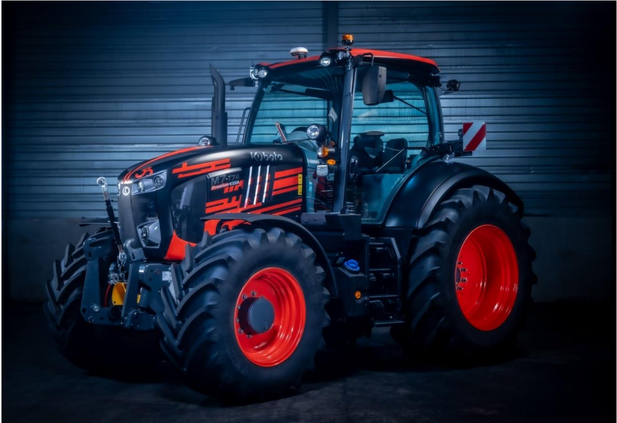
Picture: Kubota M7-174 KVT Anniversary Edition

The launch of the new M7004 series also coincides with Kubota celebrating its 50th anniversary in Europe. To mark the occasion, 50 anniversary edition M7004 tractors will be produced, each featuring a striking orange and black wrap.