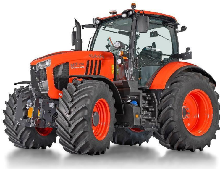
Picture: The new Kubota M7004

Kubota is proud to announce the launch of the M7004 tractor series, marking a decade of innovation in the flagship M7 tractor lineup.