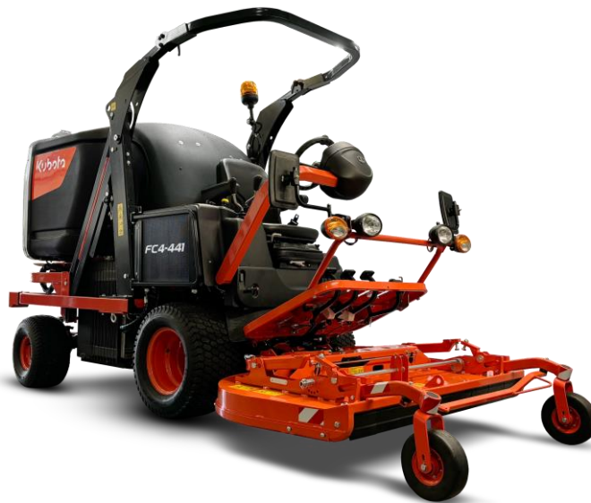
Picture: FC4-441 Prototype

Kubota is excited to announce the latest addition to its front centre-collect mower range, the new 44hp FC4-441 model.