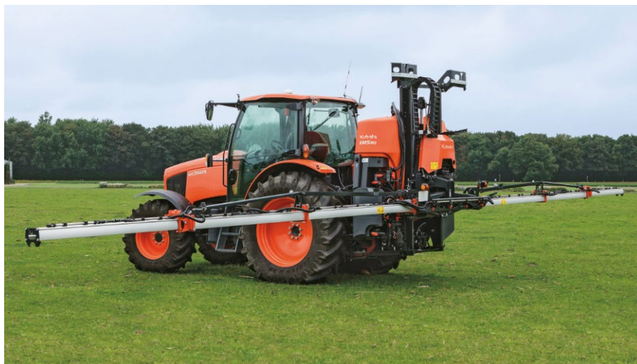
Picture: The XMS1 mounted sprayer with iXclean Plus cleaning solution

With the introduction of the iXspray software and hardware on the XMS1 mounted sprayer, Kubota is offering a complete ISOBUS compatible sprayer range with increased user friendliness for the smaller farming segment. The new optional iXclean Plus cleaning functionality ensures that the spraying job is done in an environmental friendly and safe way for the operator, but also with the highest possible accuracy and efficiency.