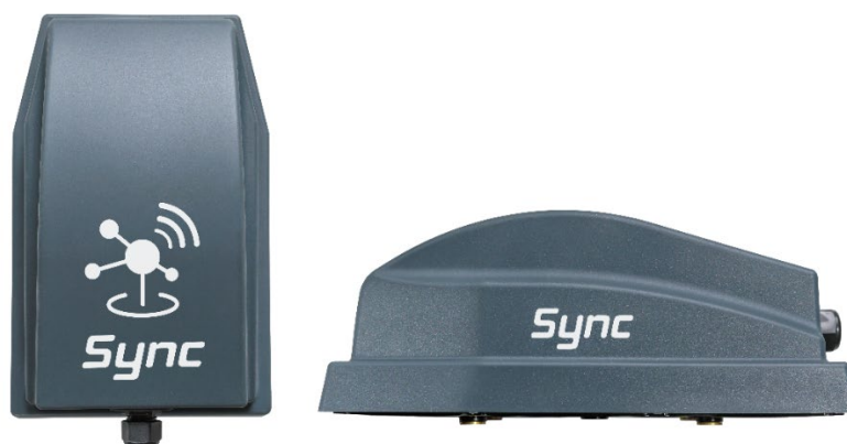
Picture: Kubota Sync - The New Implement Gateway

In celebration of Kubota's 50th anniversary, we are excited to announce a plan for a significant advancement in our product ecosystem: Kubota Sync. This new implement gateway is set to enable seamless data exchange in farming, reinforcing Kubota's ongoing commitment to productivity, quality, growth, and sustainability. As we celebrate this milestone year, Kubota Sync represents a key development in shaping the future of connected and modern farming.