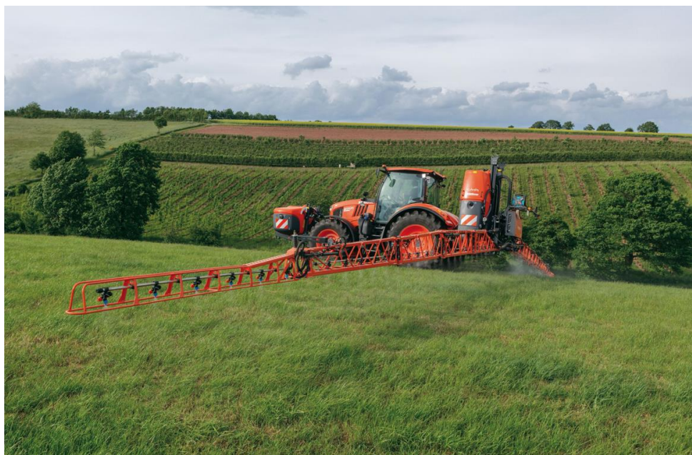
Picture: The XMS mounted sprayer range is fully ISOBUS compatible and available with new features.

Kubota is introducing a complete ISOBUS compatible XMS mounted sprayer range operating on the same software and hardware platform as the trailed sprayers. At the same time new features like the next generation Boom Guide system and TwinFill automatic filling are introduced on the XMS2 mounted sprayer range.