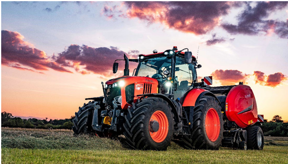
Picture: Kubota baler with new TIM Pack 2.0 feature.

Kubota TIM balers now come equipped with new unique features that improve driver comfort and safety