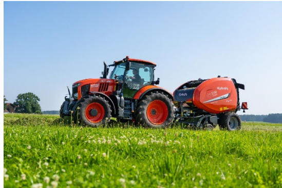
Picture: Kubota BV5160 with TIM system

Moreover, the system is designed to reduce the PTO rpm at certain stages of the baling process, which helps to minimize operational costs by reducing machine wear and fuel consumption. At this stage, one of the rare actions still in charge of the driver was the handling of the baler feeding by moving over the swath with the tractor for regular left and right crop fed in the baling chamber to obtain the best bale formation.