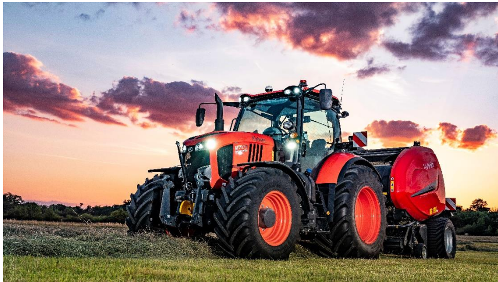
Picture: Kubota baler with new TIM Pack 2.0 feature.

Kubota TIM balers now come equipped with new unique features that improve driver comfort and safety