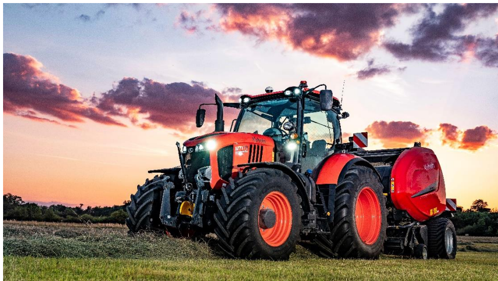
Picture: Kubota baler with new TIM Pack 2.0 feature.

Kubota TIM balers now come equipped with new unique features that improve driver comfort and safety