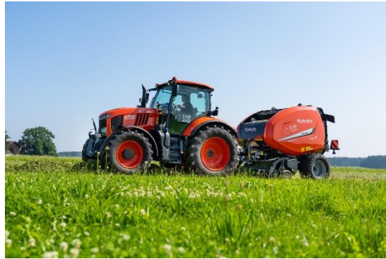
Picture: Kubota BV5160 with TIM system

Moreover, the system is designed to reduce the PTO rpm at certain stages of the baling process, which helps to minimize operational costs by reducing machine wear and fuel consumption. At this stage, one of the rare actions still in charge of the driver was the handling of the baler feeding by moving over the swath with the tractor for regular left and right crop fed in the baling chamber to obtain the best bale formation.