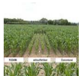
Image Kubota-PP1601TF SX PUDAMA-trial Results in Field

Image Kubota-PUDAMA-PP1601TF-SX-field Kubota PP1601TF with PUDAMA system