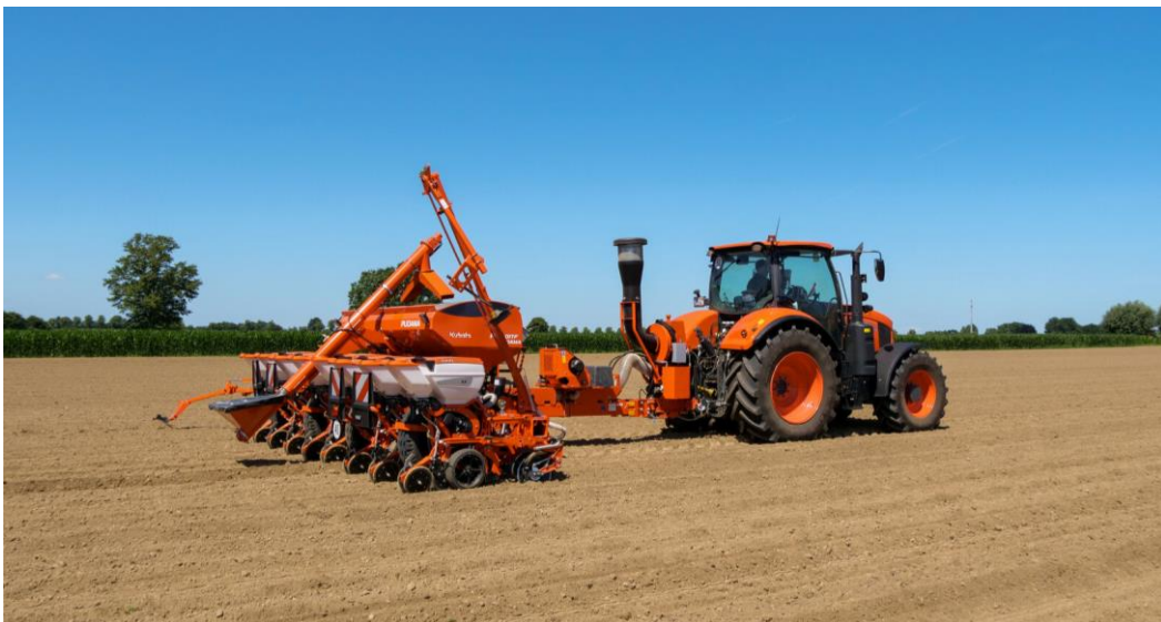
Picture: The PP1601TF with highspeed SX sowing row and PUDAMA system

The challenges in sustainable agriculture are becoming ever greater. And when times get tough, there's only one thing for it: innovative thinking. For example, considering how to achieve the same or even higher yield with lower input.