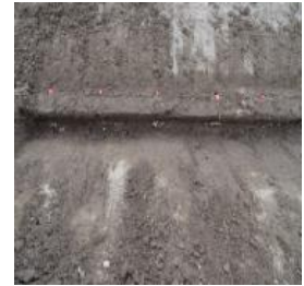
Image Kubota-PP1601TF-SX-PUDAMA-application PUDAMA spot application as deposit