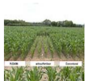
Image Kubota-PP1601TF SX PUDAMA-trial Results in Field

Image Kubota-PUDAMA-PP1601TF-SX-field Kubota PP1601TF with PUDAMA system