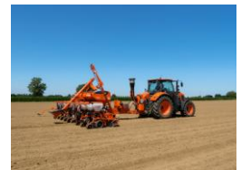
Image Kubota-PUDAMA-PP1601TF-SX-field Kubota PP1601TF with PUDAMA system