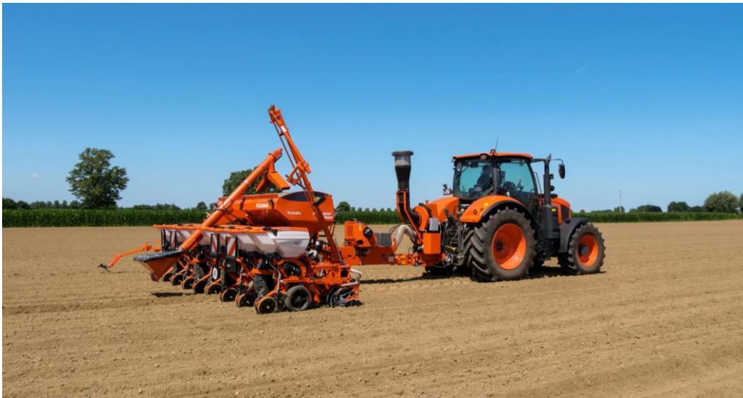
Picture: The PP1601TF with highspeed SX sowing row and PUDAMA system

The challenges in sustainable agriculture are becoming ever greater. And when times get tough, there's only one thing for it: innovative thinking. For example, considering how to achieve the same or even higher yield with lower input.