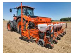
Image Kubota-PP1451V-HD-II Kubota precision drill PP1451V with HD-II row now with 60l hopper capacity

Image Kubota-PP1451V-detail Kubota precision drill PP1451V with toolbox to have all protected ready to hand