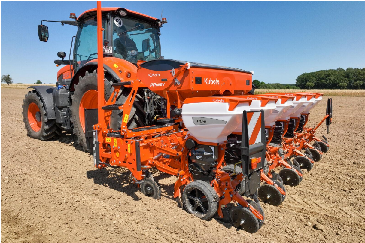
Kubota PP1451V HD-II row with 60 litres seed hopper