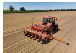
Image Kubota-PP1451V-field Kubota precision drill PP1451V with variable frame concept in field