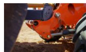
Image Kubota-PP1451V-detail Kubota precision drill PP1451V with new frame ballasting kit

Image Kubota-PP1451V-field Kubota precision drill PP1451V with variable frame concept in field