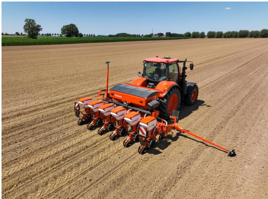
Kubota PP1451V compact precision drill with variable working width frame concept

The Kubota PP1451V with the variable working width frame concept for 6 to 8 SX or HD-II sowing units has been completely upgraded and offers even more stability and operator comfort.