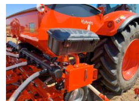
Image Kubota-PP1451V-detail Kubota precision drill PP1451V with toolbox to have all protected ready to hand

Image Kubota-PP1451V-detail Kubota precision drill PP1451V with new frame ballasting kit