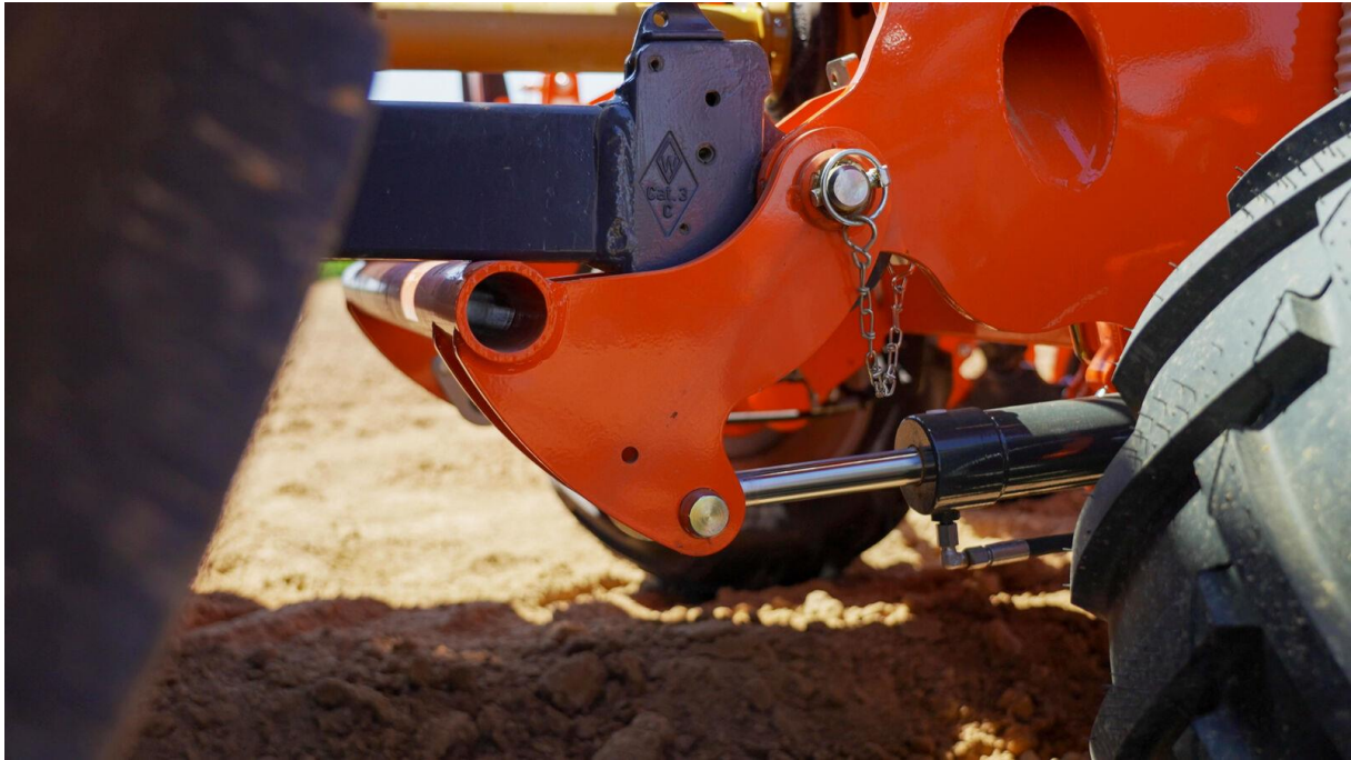
Kubota PP1451V with improved frame ballasting kit

Operators' comfort and control have been in focus for a new manometer attachment giving the driver always an unrestricted direct view at the vacuum or air pressure status.