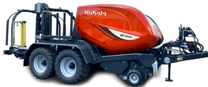
Picture: Kubota BF3500 FlexiWrap

The Kubota BF3500 range has become more versatile with the introduction of film-on-film application, which allows users to take advantage of the improvements in silage quality.