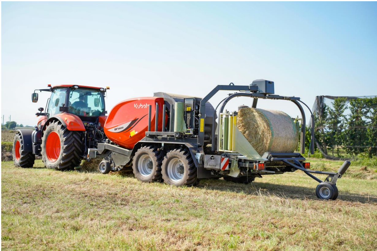
Picture: Kubota BF3500 FlexiWrap designed for high efficiency baling and wrapping.

New BF3500 FlexiWrap Kubota baler-wrapper combination