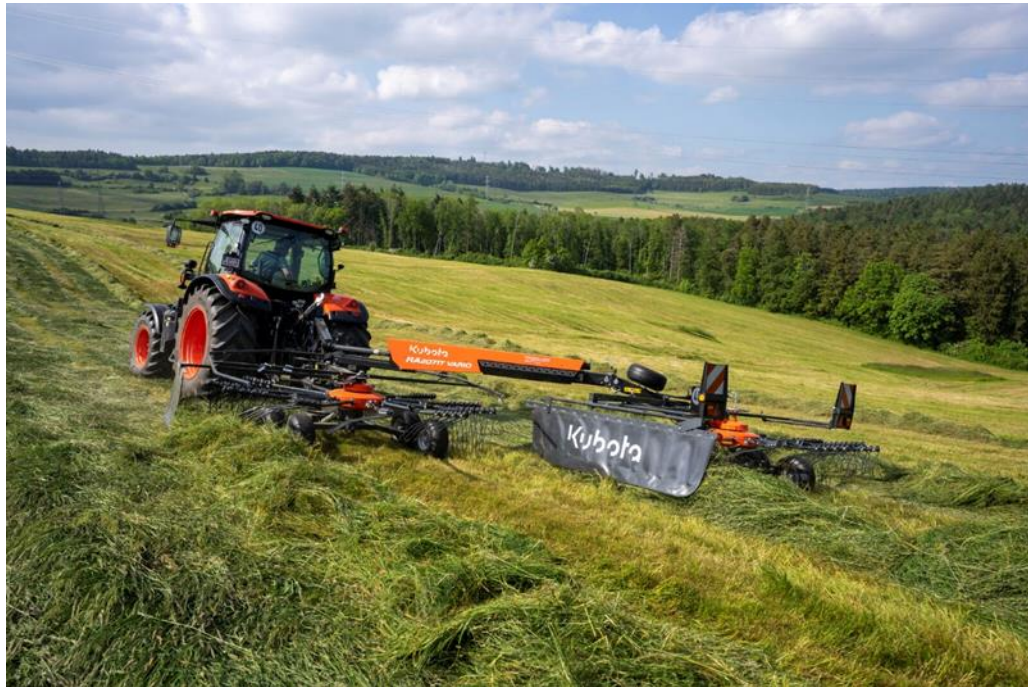
Picture: Kubota RA 2071T Vario

The Kubota RA2071T Vario is designed to provide maximum flexibility.