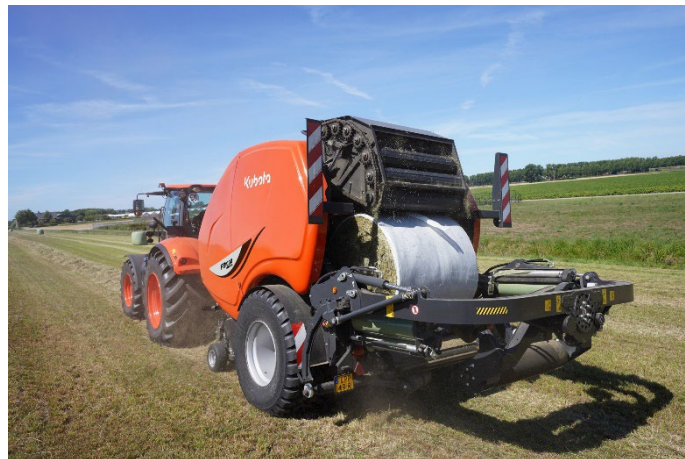
Picture: Film-on-film option

Other enhancements, including structural upgrades, more precise wrapping, and reduced crop pollution, boost machine stability and performance. Meanwhile, several extra items, such as an upgraded pick-up roller crop press, a redesigned drawbar allowing shorter turning angles, and a more precise user interface displayed on the ISOBUS terminal, are just some of the new features which make Kubota FB1000 Premium match your needs!