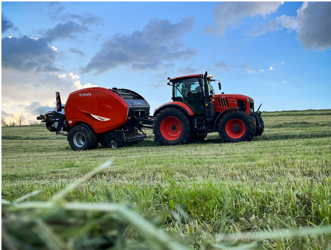
Picture: Kubota FB1000 Premium setting up new bale output target

Enhanced Kubota FB1000 Premium baler-wrapper combination