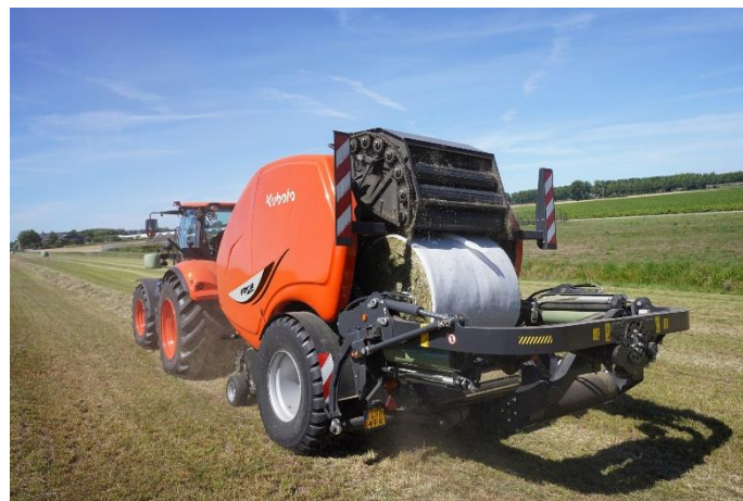
Picture: Film-on-film option

Other enhancements, including structural upgrades, more precise wrapping, and reduced crop pollution, boost machine stability and performance. Meanwhile, several extra items, such as an upgraded pick-up roller crop press, a redesigned drawbar allowing shorter turning angles, and a more precise user interface displayed on the ISOBUS terminal, are just some of the new features which make Kubota FB1000 Premium match your needs!