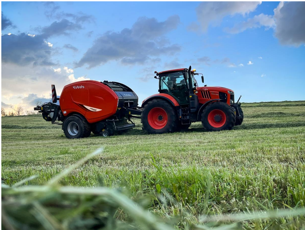
Picture: Kubota FB1000 Premium setting up new bale output target

Enhanced Kubota FB1000 Premium baler-wrapper combination