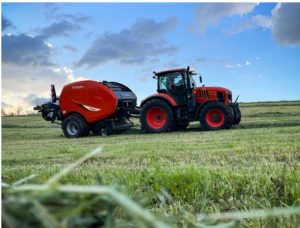
Picture: Kubota FB1000 Premium setting up new bale output target

Enhanced Kubota FB1000 Premium baler-wrapper combination