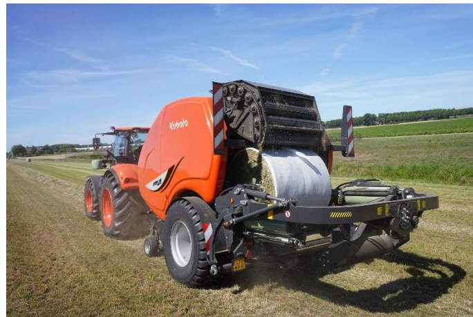
Picture: Film-on-film option

Other enhancements, including structural upgrades, more precise wrapping, and reduced crop pollution, boost machine stability and performance. Meanwhile, several extra items, such as an upgraded pick-up roller crop press, a redesigned drawbar allowing shorter turning angles, and a more precise user interface displayed on the ISOBUS terminal, are just some of the new features which make Kubota FB1000 Premium match your needs!